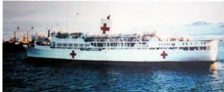
Above: The Hospital Ship Uganda , photographed while in the South Atlantic. This image was on display at the Imperial War Museum during its Falklands 25th Anniversary Exhibition. Nicci Pugh will be bringing the photograph to the Falklands later this year to present to the Museum.

BLESMA and SAMA82, had grown from "a pie and a pint in a pub" to a "magnificent event" on board Aurora .