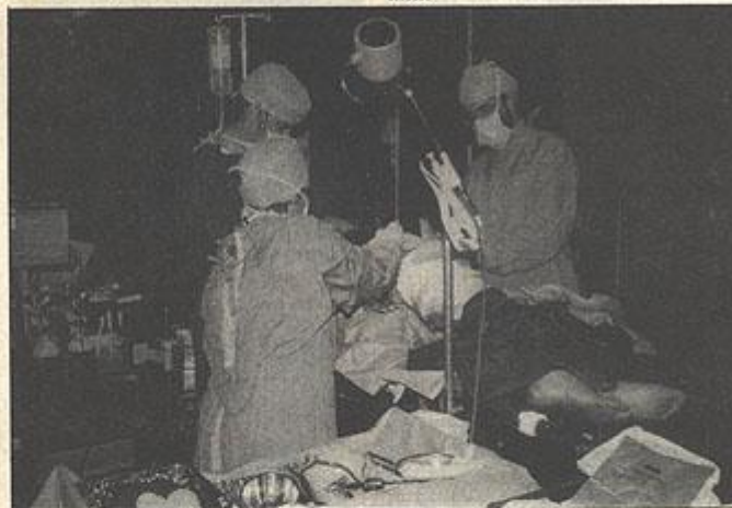
Above: the operating theatre in the ballroom. Below: the ITU.